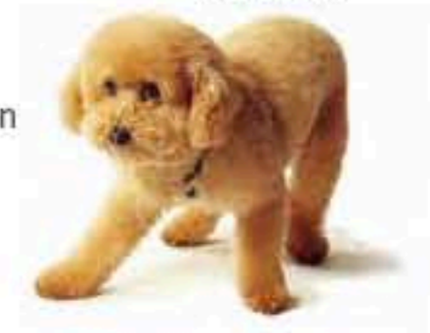
Visiting therapy dogs can make the day super special.

All health services, except for emergency services, must be provided and/or coordinated by Albright LIFE. Participants may be held financially liable for unauthorized, non-emergency services.